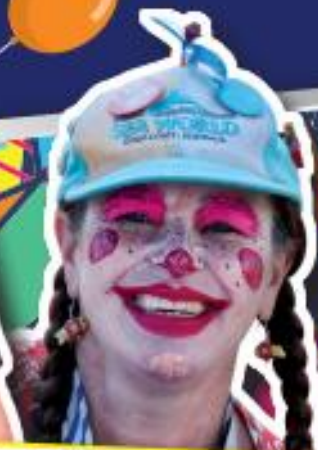
SPARKLES THE CLOWN!