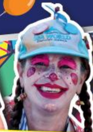
SPARKLES THE CLOWN!