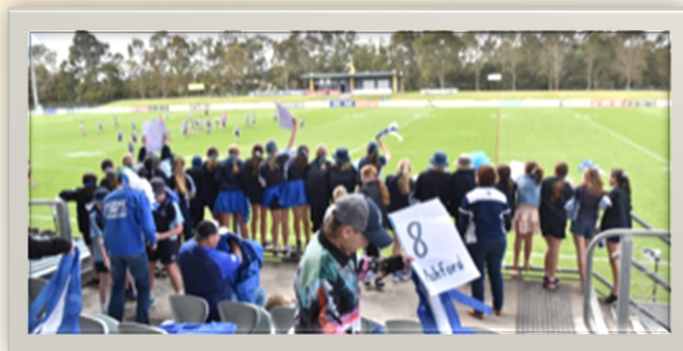
Our fiercely supportive Scone Public School Cheer Squad.