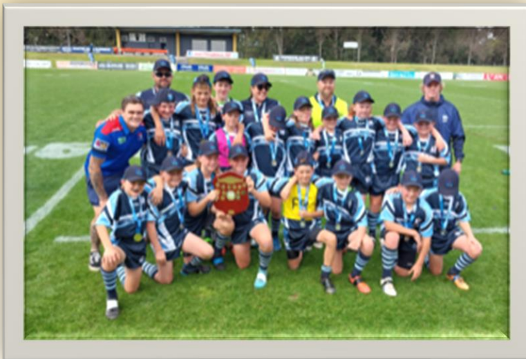
Celebrating the win as the number one team in NSW