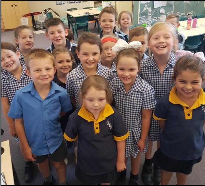
All of 1C were eligible to attend midterm Rewards Day! They enjoyed a sausage sandwich and ice block on Friday.