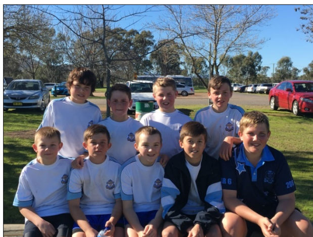
Scone Public School Boys Touch Team