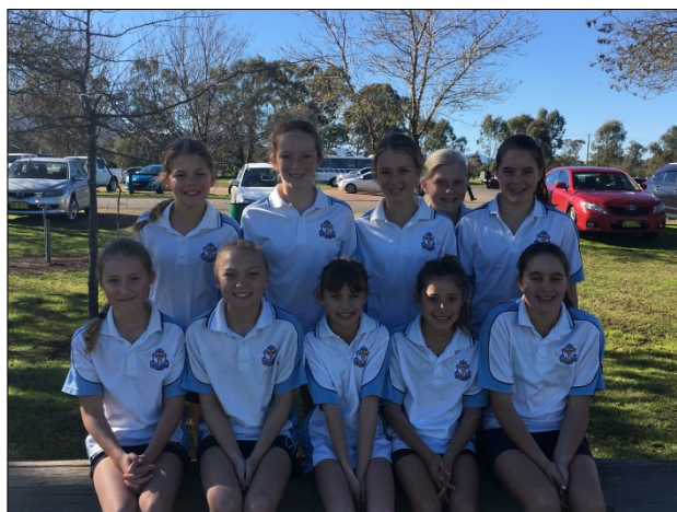
Scone Public School Girls Touch Team