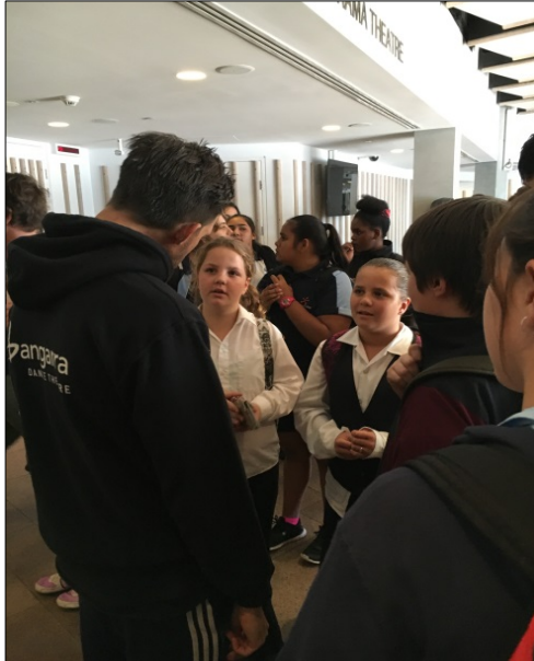
Students at the Bangarra Dance Festival