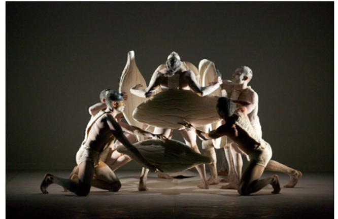
Bangarra Dance Company

Miyagan which was a piece that explored the Kinship systems in Aboriginal society and the way these systems are designed to sustain culture and