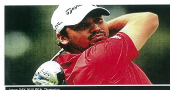
Jason DAY 2015 PGA Champion

Jack Newton Junior Golf Foundation and Royal Sydney Golf Club have been kind enough to donate plenty of Golf Sets