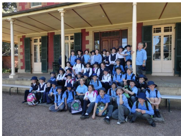
Stage two ready for a big day