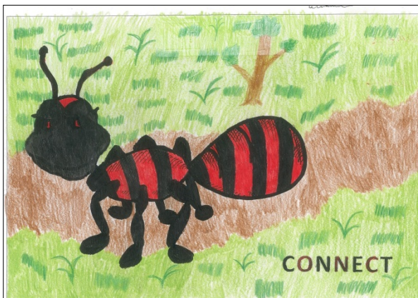
Kenny the connecting ant