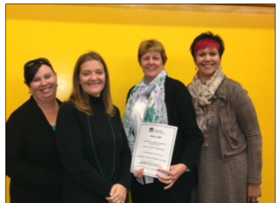
The Scone Public School's Aboriginal Education Team: for being an active, committed