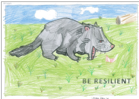
Rex the resilient Tasmanian devil