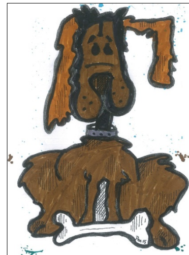
Pixie the persistent dog

Thanks to everyone who entered the competition and look out for the posters going up in your classrooms soon! SRC