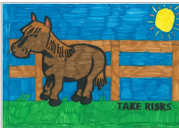
Tammy the risk taking horse