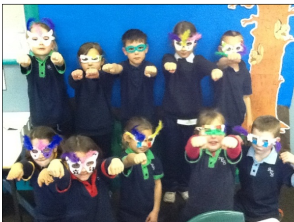
KH in their superhero masks – Education week