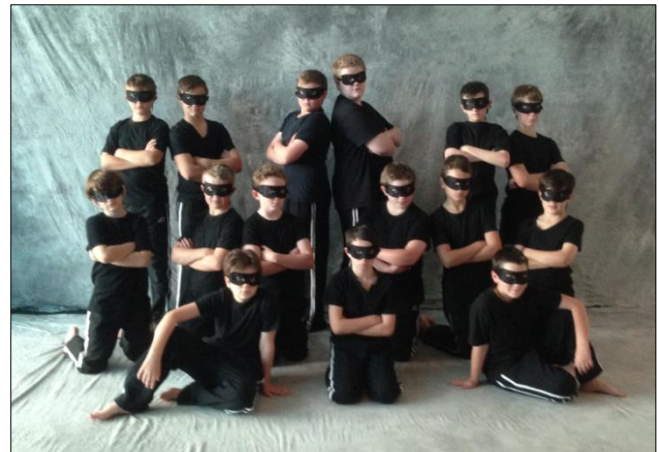
Year 6 Boys Hip Hop