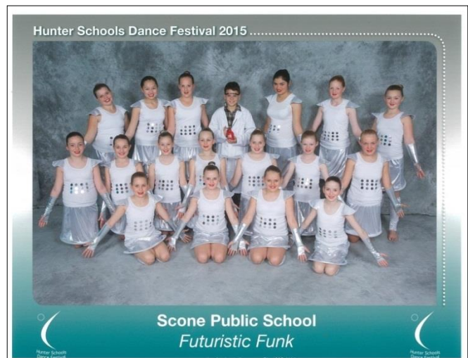
Year 6 Girls Dance Group