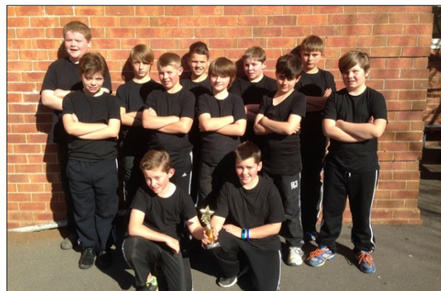
Boys Hip Hop Group