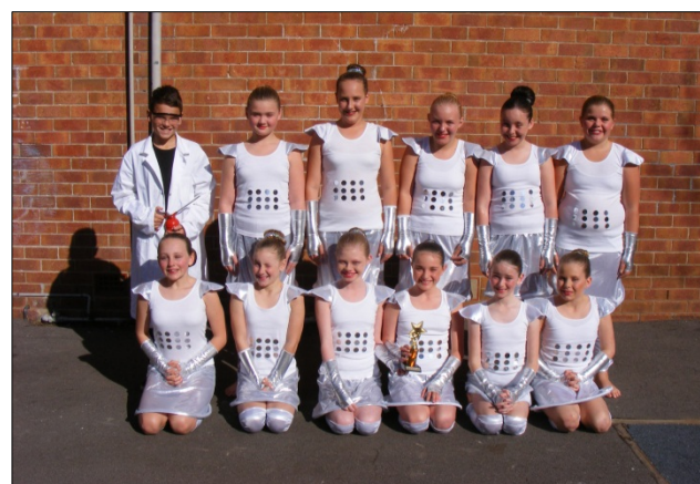
Yr 6 Girls Dance Group