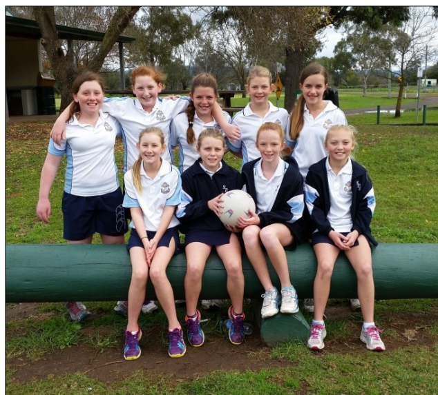
Scone Public School Girl's Netball Team