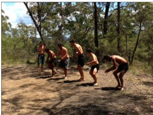
Wakagetti Dance company