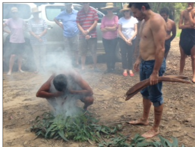
Sacred Smoking Ceremony