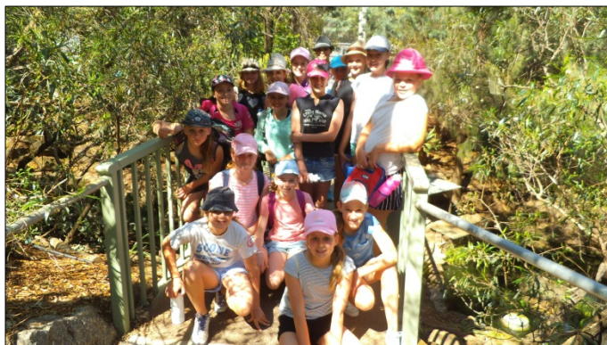
A well-earned visit to the aviary at the Marsupial Park in Tamworth

S is for the sights and they all want us to come back next year.